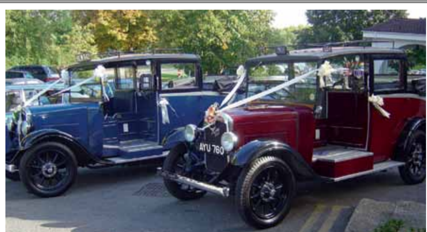
"WHERE TO?" BERTIE (BLUE) AND THOMAS (MAROON)

.....SOMETHING SPECIAL FOR THE WEDDING IN YOUR FAMILY..... HOW ABOUT ONE OR TWO GENUINE 1934 LONDON TAXIS? REAR HOODS CAN BE LOWERED IF DESIRED FOR SUPERB PHOTO OPPORTUNITIES. PLEASE CALL FOR AN INFORMAL NO OBLIGATION DISCUSSION AND/OR ARRANGEMENT TO VIEW THE CARS.