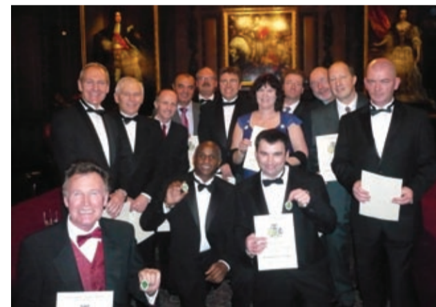
Newly Qualified Cab Guides