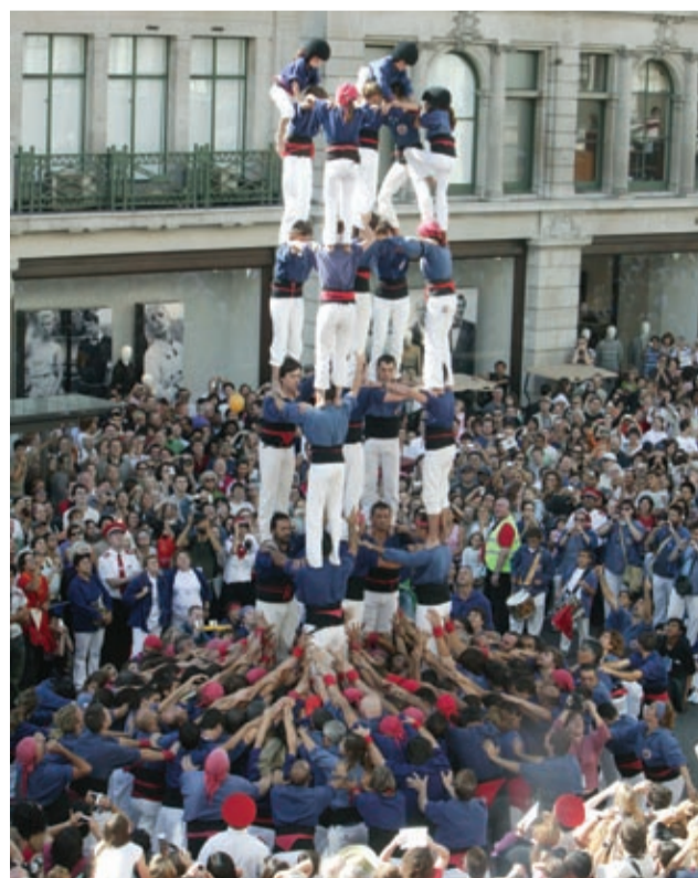
Regent Street Festival 2005 - An English Country Garden