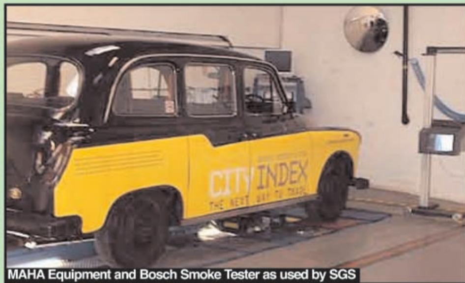
MAHA Equipment and Bosch Smoke Tester as used by SGS