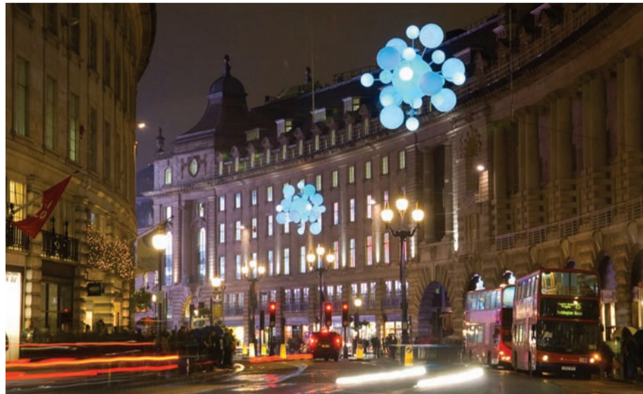
Regent Street Lights 07

Christmas is a special time of year and for taxi drivers it is usually a busy time too. As you drive along Regent Street with passengers each day, the lights this year add a new dimension as they change colour in response to the volume of shoppers on the street. Starting on Christmas Day, the lights will produce a commemorative show for each of the twelve days of Christmas. Called Unity, the lights are supplied by Regent Street and Nokia. A new flagship Nokia store opens on 14th December which will be the largest Nokia store in the world. There will be touch sensors in the store where visitors will be able to affect the lights outside.